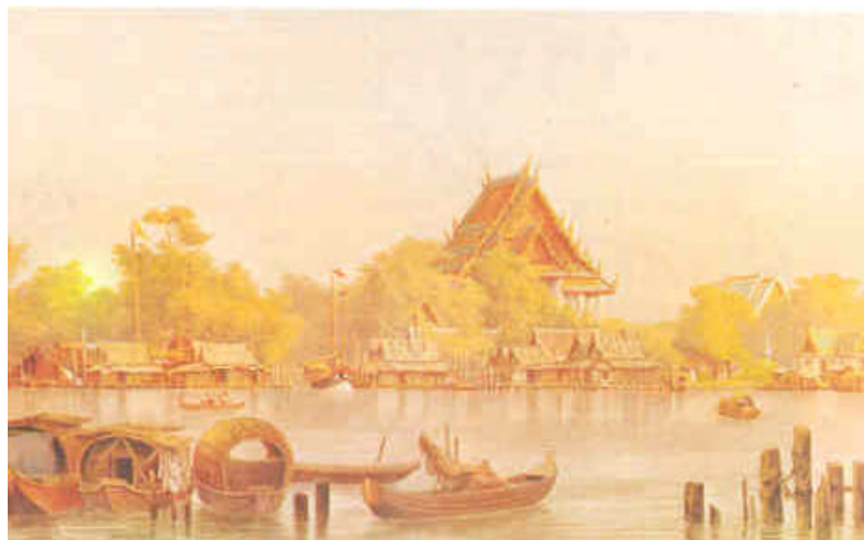
Wat Kalaya, one of the larger monasteries in the capital, located on the west side of the Chao Phraya river. The main building, the boat, house a colossal gilt statue of The Buddha in a sitting posture.

the tower there is a gallery which may be reached by clambering up a ladder-like flight of stone steps. The view from this gallery is magnificent; from here one gets a full impression of the capital. The stately river is covered with craft of all description and thousands of floating houses. The royal city on the opposite bank is reflected in the stream; its gilded roofs and mosaic gables shining like rubies and sapphires. The remainder is one unbounded forest, interrupted only by the highest roofs and the tallest towers; all the creeks and canals lined with thousands of habitations being buried in the dark green foliage. Of the inhabited city only those parts bordering the river are visible. Wat Chang is the focus of picturesque 'Bangkok'.