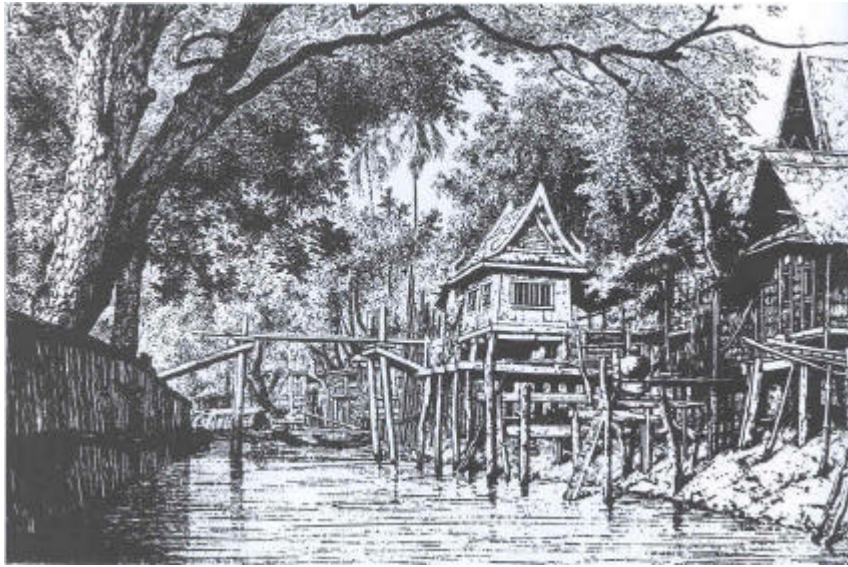
Heavily trafficked watercourses lined with close-standing structures pass through the heart of the city. Bridges commonly are single planks without a parapet; few are of more substantial stuff, but this is understandable since there is little movement overland.