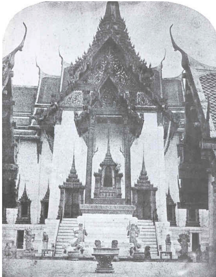
Old Reception Hall in the Palace of the First King of Siam. The Dusit Maha Prasat.